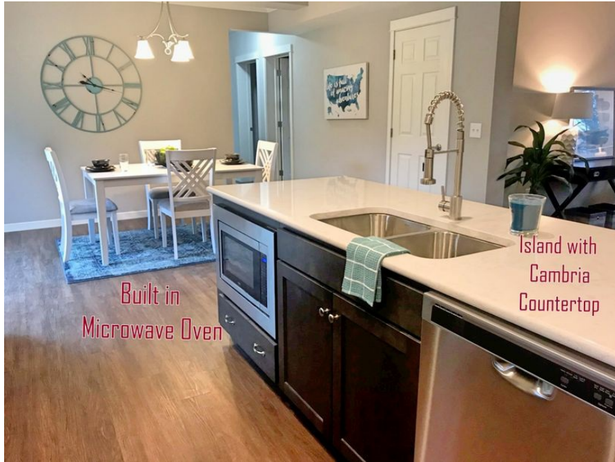
Built in Microwave Oven